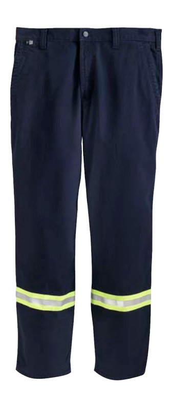
63685 Carhartt® FR Enhanced Visibility Pant 9 oz Navy (20) ATPV 12, ARC 2 ASTM 1506, UL 2112 Certified