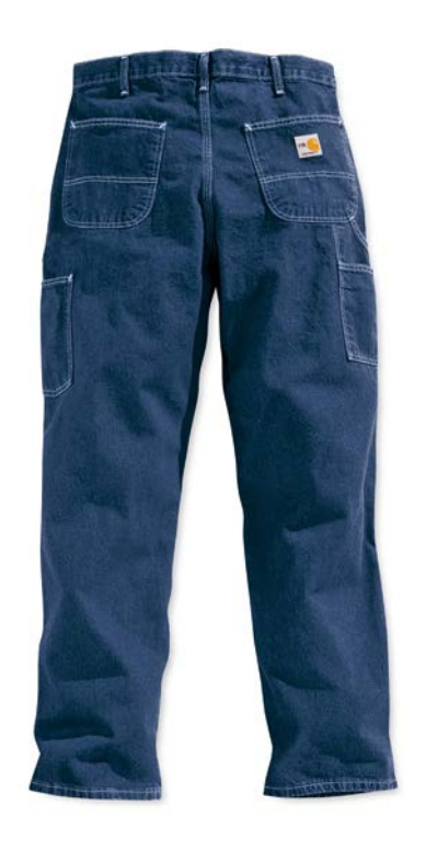
290 Carhartt® Carpenter Jean 11.75 oz, 100% FR cotton Denim (83) ATPV 15.2, ARC 2 UL 2112 Certified