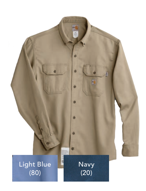
294 Carhartt® 88/12 Long Sleeve Shirt 6.5 oz

6.5 62 Khaki (62), Light blue (80), Navy (20) ATPV 9.5, ARC 2 ASTM 1506, UL 2112 Certified