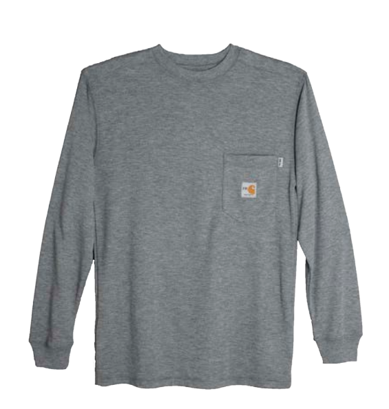
297 Carhartt® Long Sleeve T-Shirt 6.7 oz Heather Gray (31) ATPV 8.2, ARC 2, UL 2112 Certified