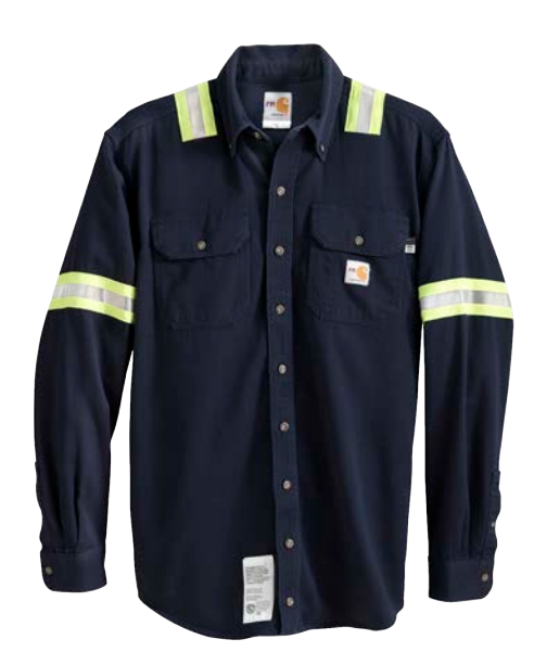
63680 Carhartt® FR Enhanced Visibility Shirt 6.5 oz Navy (20) ATPV 9.5, ARC 2 ASTM 1506, UL 2112 Certified