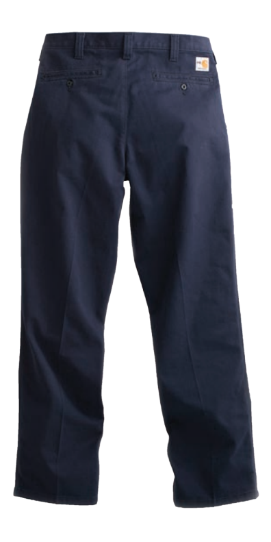
371 Carhartt<sup>®</sup> 88/12 Pant 9 oz Navy (20) ATPV 12, ARC 2 ASTM 1506, UL 2112 Certified

6.5 62 Khaki (62), Light blue (80), Navy (20) ATPV 9.5, ARC 2 ASTM 1506, UL 2112 Certified