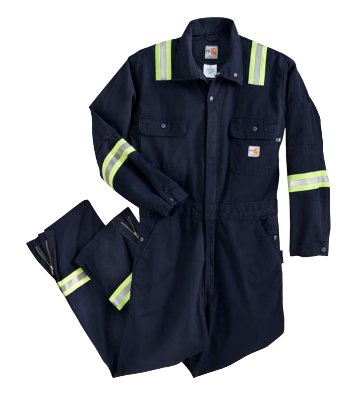
63686 Carhartt® FR Enhanced Visibility Coverall 7 oz Navy (20) ATPV 8.6, ARC 2 ASTM 1506, UL 2112 Certified