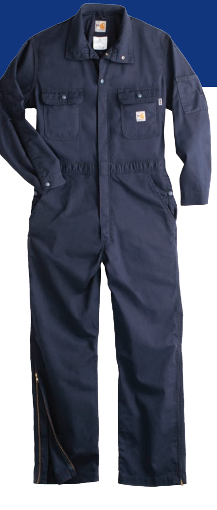
391 Carhartt® 88/12 Coverall 7 oz Navy (20) ATPV 8.6, ARC 2 ASTM 1506, UL 2112 Certified