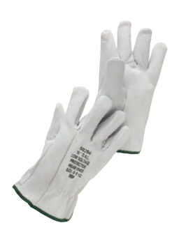
86938 Leather Glove Protectors 10" and 12"