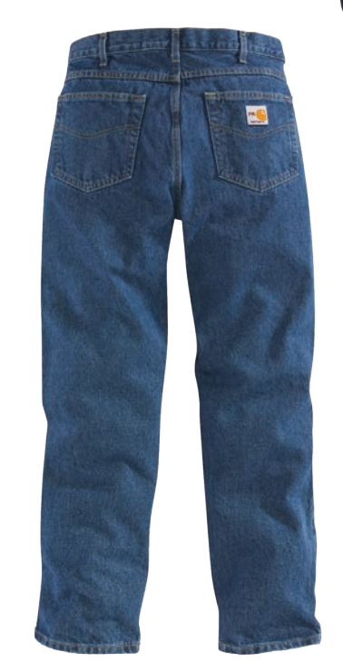
280 Carhartt® Jean 14.75 oz, 100% FR cotton Denim (83) ATPV 23.8, ARC 2 UL 2112 Certified