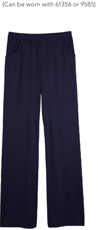
746 Navy (20)